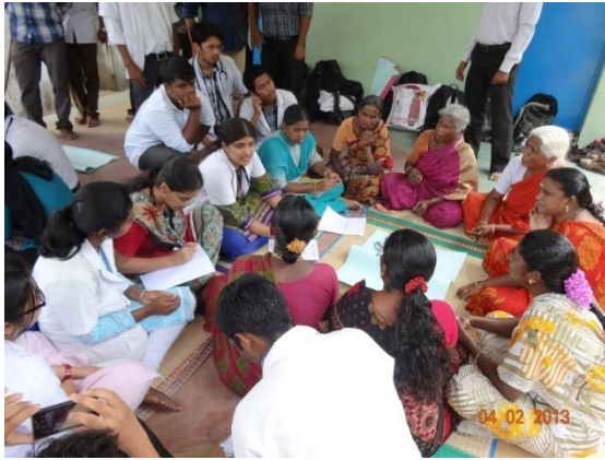
Figure 1: Medical students meeting with community members for body mapping exercise

Before the activity, instructions were given by the postgraduate students of Community Medicine. Community members were requested to draw the body map based on their perception about the effect of the diseases (in terms of symptoms and complications—in order of frequency and of perceived severity). After every member of the group had given their opinion a consensus was drawn by the group. This body mapping activity took 30 minutes to complete. The body map drawn by the community is shown in figure 2.